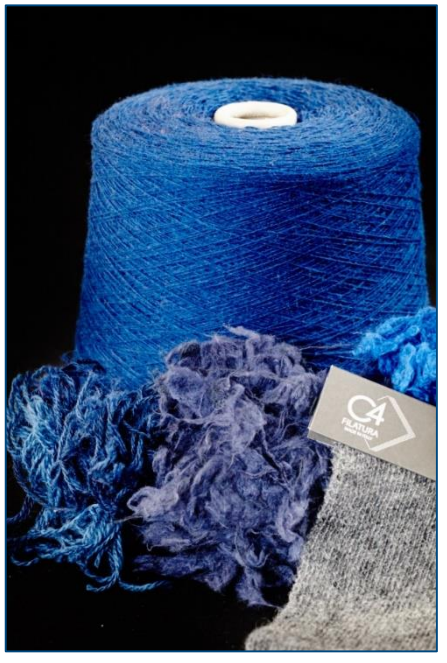
Products by FILATURA C4

The yarns in this Re.Verso<sup>™</sup> collection are manufactured from a combination of natural fibers, mainly re-engineered wool coming from pre-consumer textile materials, with artificial, traditional synthetic and technical fibers.