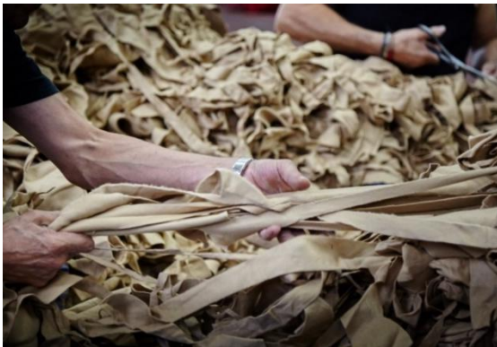
The selection of pre-consumer cuts

Re.Verso™ is the brand of a new, fully transparent, certified and traceable Italian textile system intended for wool and cashmere. The integrated supply chain can boast incredible savings in terms of energy (-76%), water (-89%) and CO 2 emissions (-96%), as certified by the LCA (Life Cycle Assessment) study led by PRIMA Q (the figures below refer to wool).