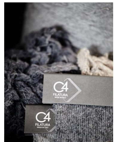
Re.Verso™ yarn by Filatura C4

As to show the strong significance of this project within the new realm of circular economy, this innovative collection was chosen by Heimtextil for two particularly prominent initiatives: